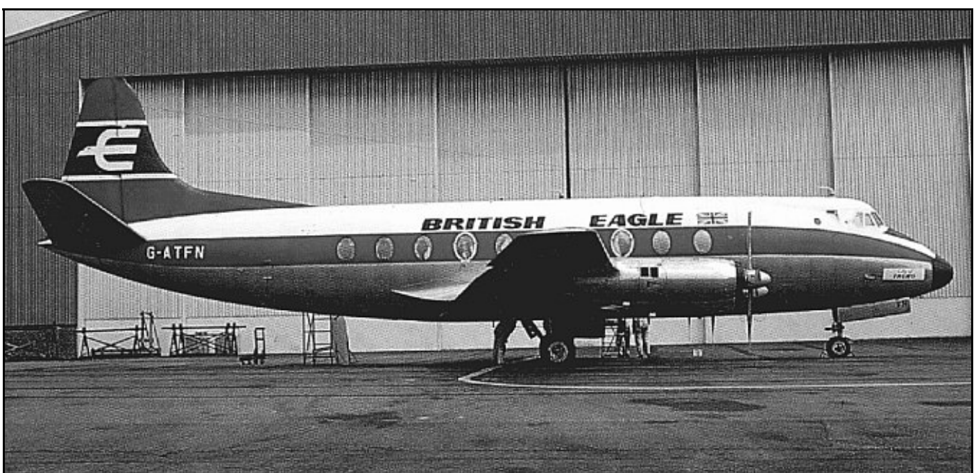
The ill-fated British Eagle Viscount G-ATFN, City of Truro

The electrical system on the Viscount consisted of 4 generators powered by the engines and 4 batteries feeding a main busbar (common rail) with DC power via control circuits. This busbar fed various services and instruments on the aircraft with DC